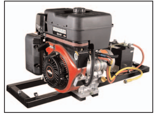
Quick Change Power Pac™