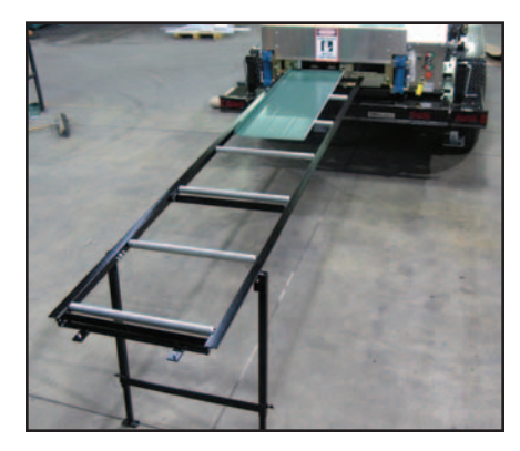
Run Out Table