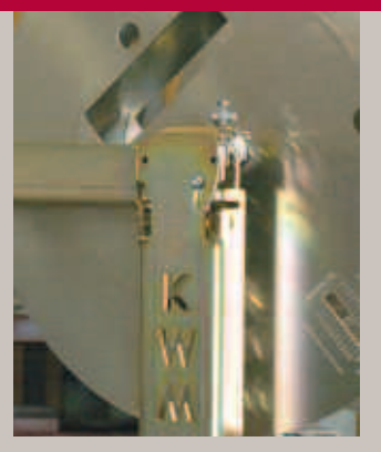
New upright, tension brake, aluminum spool and coil scale